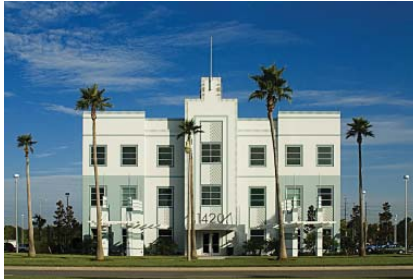
Celebration Office Building Celebration, FL