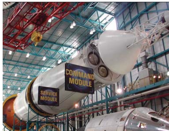
NASA Saturn V Center* Orlando, FL