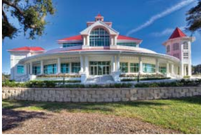
Haines City Banquet Hall Haines City, FL