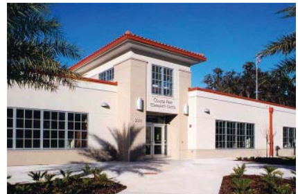
College Park Community Center Orlando, FL