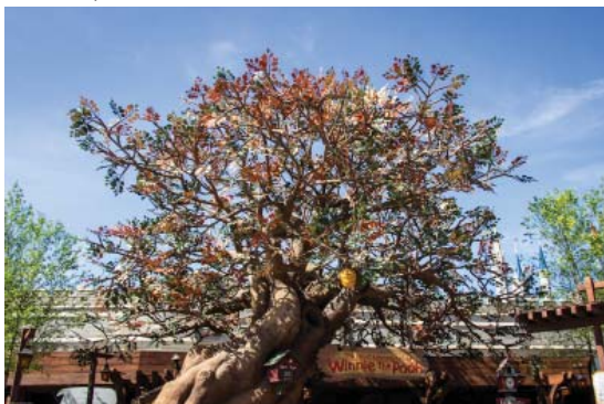
Winnie the Pooh Tree