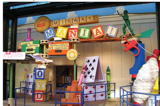
Toy Story Midway Mania