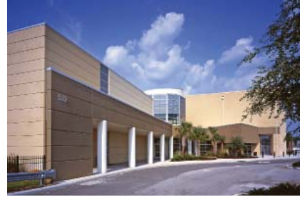
Northland Church Orlando, FL