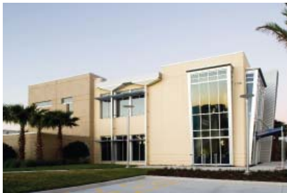
Verdelyte Office Building Lake Mary, FL