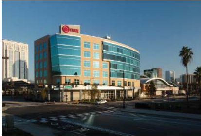
Lynx Bus Station Orlando, FL