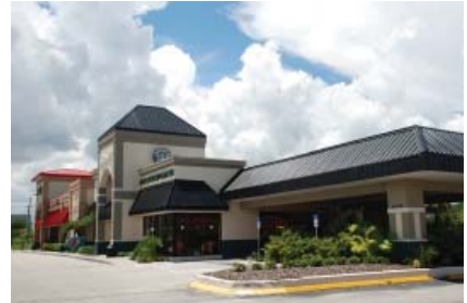
Various Starbucks Locations United States