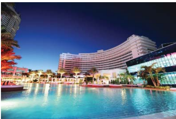
Fountaibleau Miami Beach

Disney's Art of Animation Resort is a themed hotel in Walt Disney World focused on the animation movies. ASD was apart of the team to develop the 1.3 million gsf new resort area. This project consisted of 8 new guest room buildings, renovations and addition to 2 guest room buildings, pool equipment building, and renovation of the 69,000 sf commercial building and numerous icons. Total Cost: $360 million.