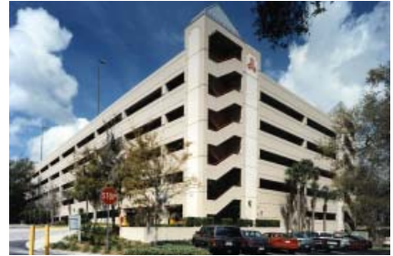
ORMC Parking Garage* Orlando, FL