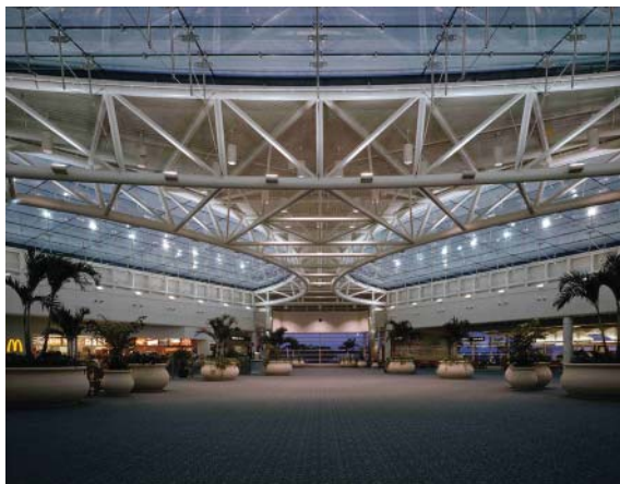
OIA Airside 2* Orlando, FL

The scope of work for this project included the design and construction of the new and expanded rental car Quick Turnaround Areas (QTA) and associated improvements to the existing Terminal A and new B Rent-A-Car (RAC) facilities. The project includes expansion, rehabilitation, and re-configuration of Terminal A QTA including new fueling and wash rack facilities; new Terminal B QTA including new fueling and wash rack facilities; conversion of Terminal A garage QTA to rental car ready return spaces. Total Cost: $50 million.