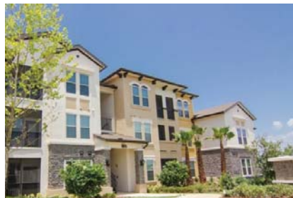
Vineyards at Hammock Ridge