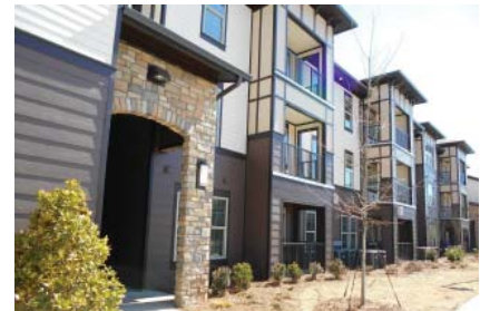
The Addison at South Tryon