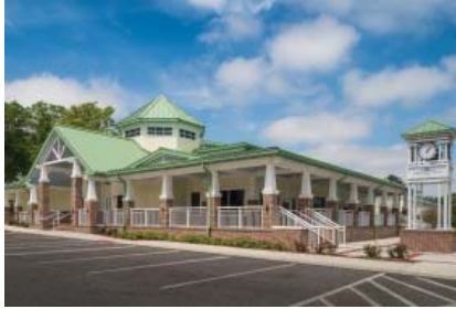
Ocoee Lakeshore Center Ocoee, FL