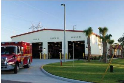
Various Fire Stations Orange County, FL