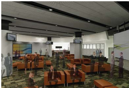
OCCC Destination Lounge Orlando, FL