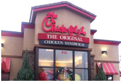
Various Chick-fil-A Locations United States