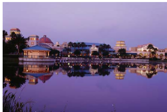
Disney's Coronado Springs Resort